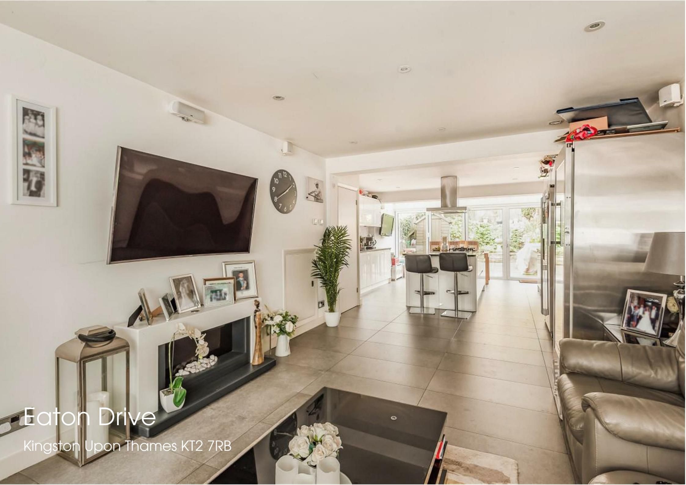
Eaton Drive Kingston Upon Thames KT2 7RB